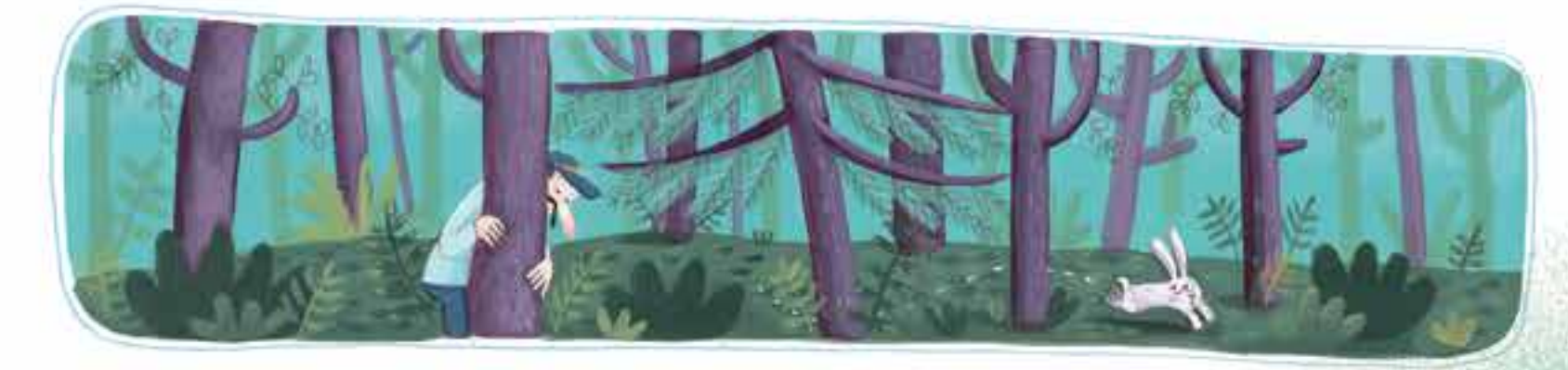
he peers among the trees...