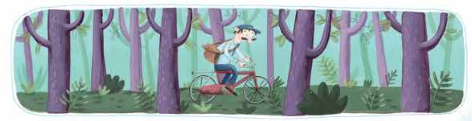
beyond the trees...