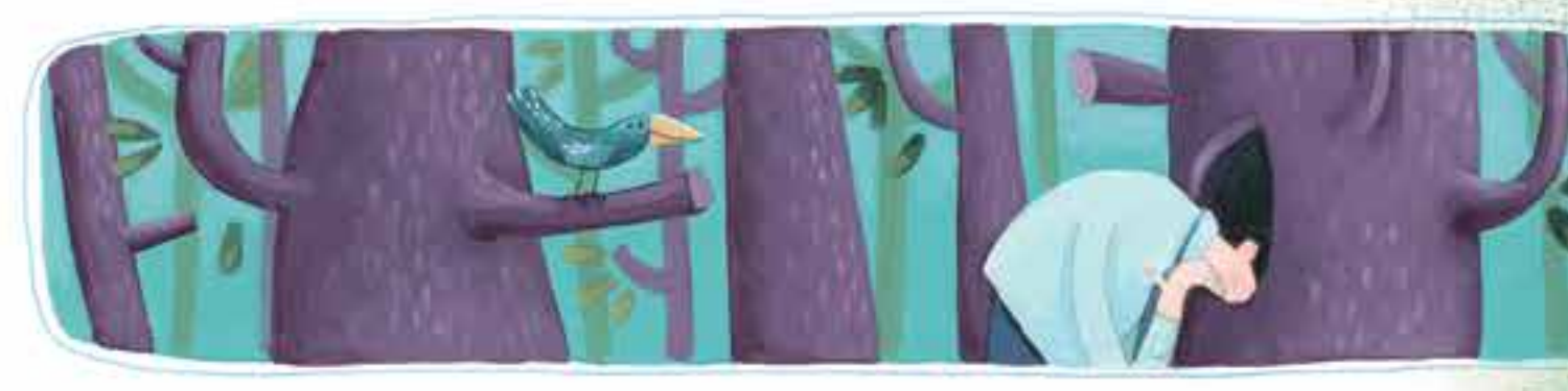
he gazes into the hollows...

and under the roots ... but he can't find any fairies.