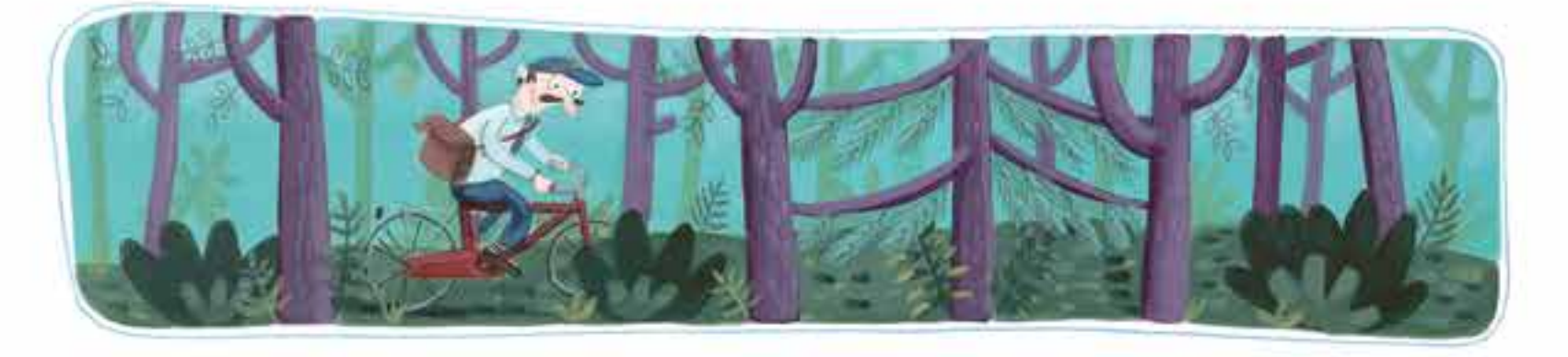
deeper and deeper into it...

He hops onto his bicycle and heads off towards the forest,