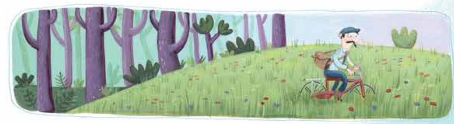
across the clearing...

"Is there anybody here? Can anybody hear me?" he shouts, hoping that someone will answer. Soon he hears a little voice from among the flowers. It's the voices of Farrah the Flower Fairy "Who are you? Who are you looking for?" the Flower Fairy asks.